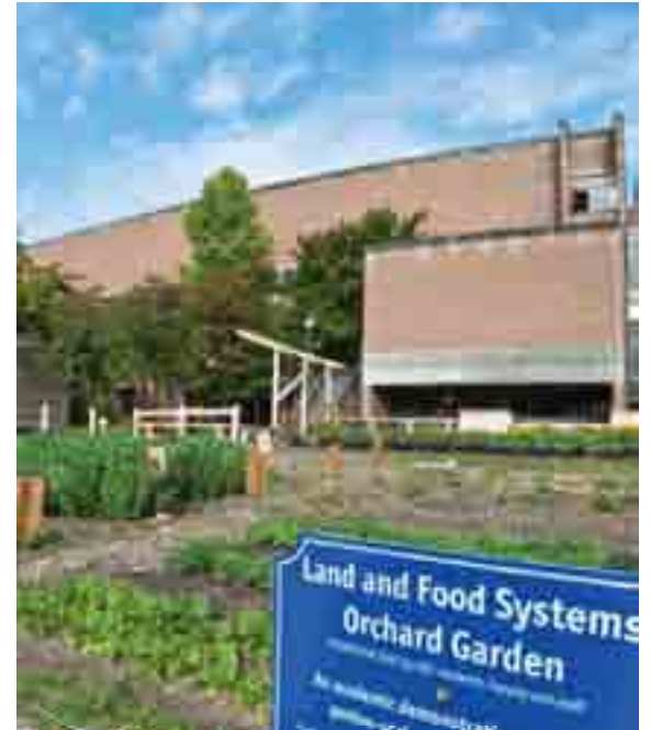
SOLUTION & IMPACTS