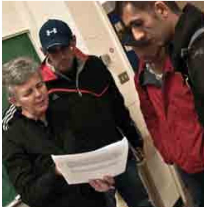
STUDENTS & FACULTY