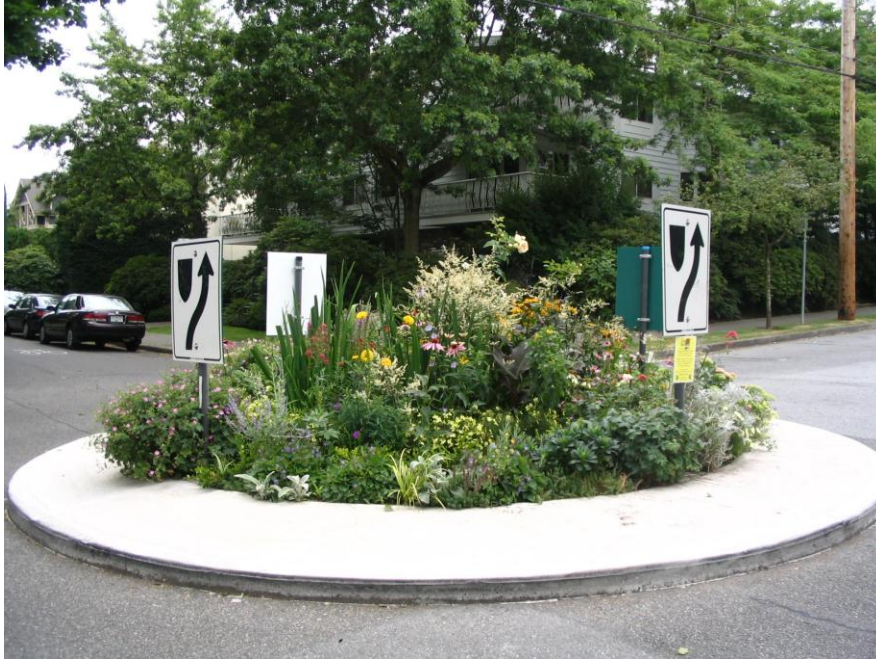
Figure 4: Vancouver’s Green Streets Program – 10 th and Pine (City of Vancouver, 2007a).