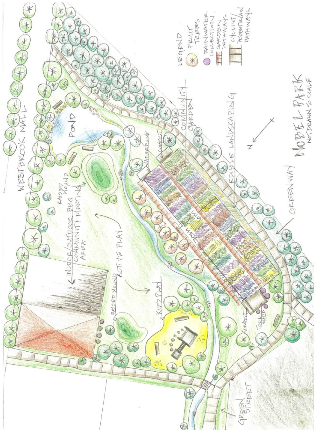
Figure 1: Nobel Park Design