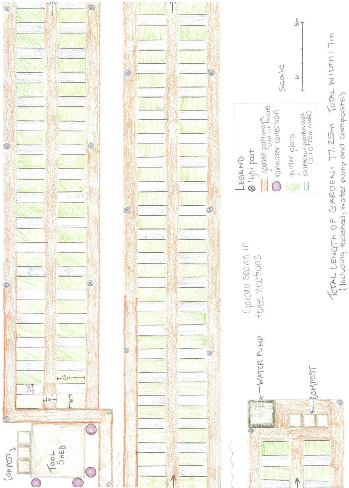
Figure 2: Community Garden Design