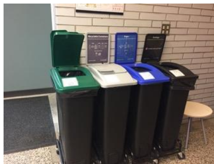
(b) Small Bin