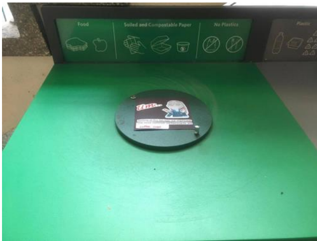
Figure A4: Feedback Tag Placement