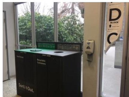
(a) Large Bin