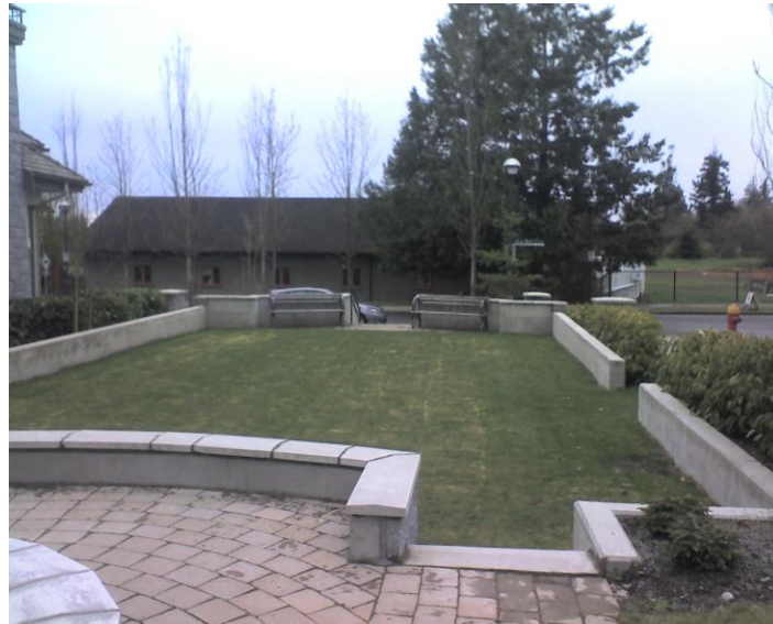
Figure 3. Photograph of Proposed Community Garden Site.

The proposed community garden location at Hawthorn Place is situated at the corner of Larkin Dr. and West Mall. This plot of land is currently planted with only grass and is underutilized. It is situated adjacent to a single home and open on the East and West sides to the road and on the North side to a walkway. This plot is ideal for a community garden as it is flat, exposed to sun and is easily accessed.