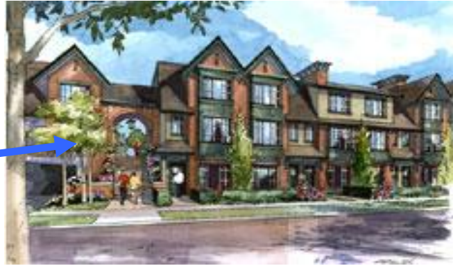
Figure 2. Overview of Hawthorn Place.

The proposed community garden location at Hawthorn Place is situated at the corner of Larkin Dr. and West Mall. This plot of land is currently planted with only grass and is underutilized. It is situated adjacent to a single home and open on the East and West sides to the road and on the North side to a walkway. This plot is ideal for a community garden as it is flat, exposed to sun and is easily accessed.