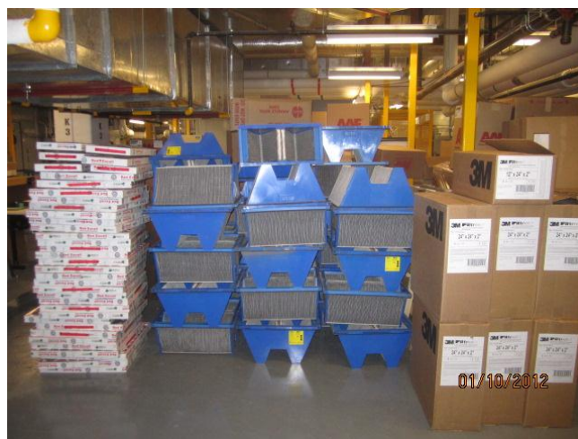
Figure 1.Pre filter, Box filter, 3M filter

From January 9 th to 14 th 2012, Nalco cleaned coils and changed the air filters on 11AHU's(2,3,5,6, 9,27,27A,28,28A,29,29A,34) at the Life Sciences Centre. Nalco also replaced the air filters on AHU #10 and the main plenum servicing all 34 AHU's.