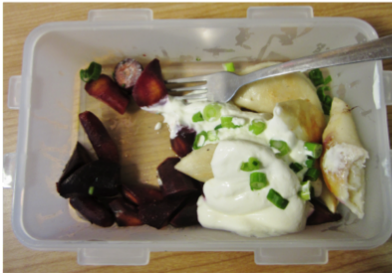
Figure 1: The Eco-to-Go Reusable Container

Since 2010, UBC Food Services has operated the Eco-to-Go program in several locations on campus, primarily in Totem Park and Vanier residences. This program allows students to exchange $5 for a reusable plastic container, which can be filled, cleaned, and exchanged at different locations. Each time the container, the student receives a small discount on the purchase for helping reduce the number of disposable containers used on campus. As part of the Lighter Footprint Strategy, the AMS (Alma Mater Society) has proposed to integrate the Eco-to-Go program into the new SUB (Student Union Building). The goal of this report is to perform a triple bottom line analysis of the environmental, economic, and social requirements and predicted effects of bringing Eco-to-Go to the new SUB.