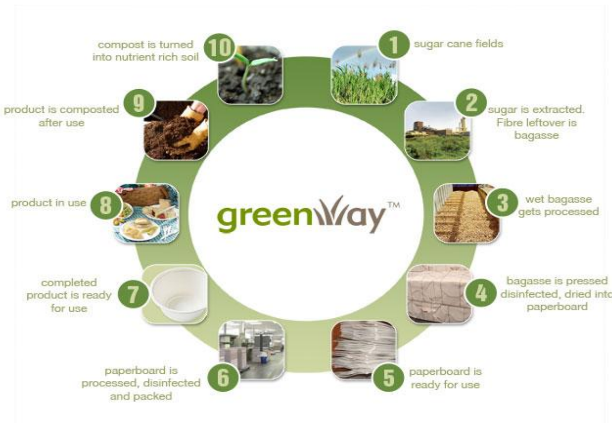
Figure 2. Life Cycle of Bagasse

tree (ecoKloud,2012). Sugarcane paper is also recyclable with paper made of wood-fibre (Shaigany, 2013). Sugarcane paper is renewable, reliable, and recyclable, but it renews and biodegrades faster than wood fibre paper. UBC has a standard of using paper that is 30 percent post-consumer waste content, and if both wood fibre and sugarcane paper can be recycled, sugarcane paper would be a better idea to encourage the purchase to make responsible environmental choices.