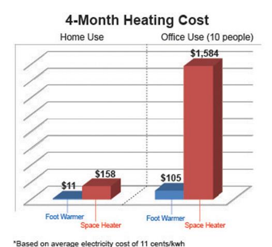
Figure 3. A 4-month electricity cost comparison between 10 regular office heaters and 10 Cozy Products heaters.

When this radiant panel heating technology is applied to office space heaters, the Cozy Legs manufacturer's website shows that if 10 regular 1500W regular office heaters are replaced by ten 150W Cozy Legs heaters, the total electricity costs can be cut by over 90% <sup>[10]</sup>. This is shown in Figure 3. Additionally, the CO<sub>2</sub> emissions can be reduced by a total of 14.57 tons per year <sup>[10]</sup>. Compared to the annual CO<sub>2</sub> emission of 5.1 metric tons from a passenger vehicle <sup>[11]</sup>, this is equivalent to almost to the total emissions from 3 passenger cars per year. Table 6 shows the total amount of energy that will be saved for UBC with 1000 units of each heater model per year by replacing the current heaters. Being the heaters with one of the lowest power rating out of the four models being studied, the two Cozy Legs (100W) & (150W) will be the heaters that provides the most waste reduction and energy savings.