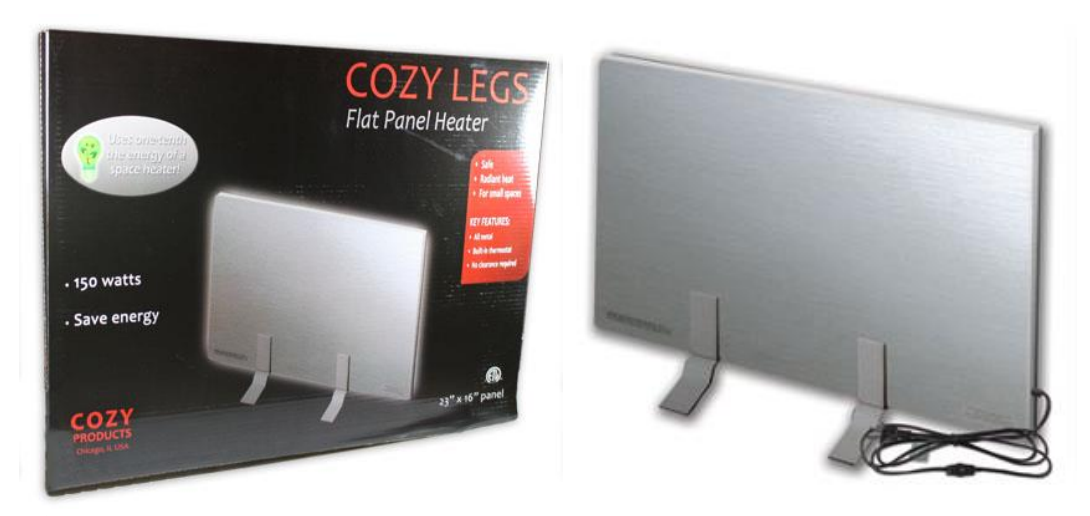
Figure 1: Heater chosen: INDUS-TOOL Cozy Legs Flat Panel Heater (150W).