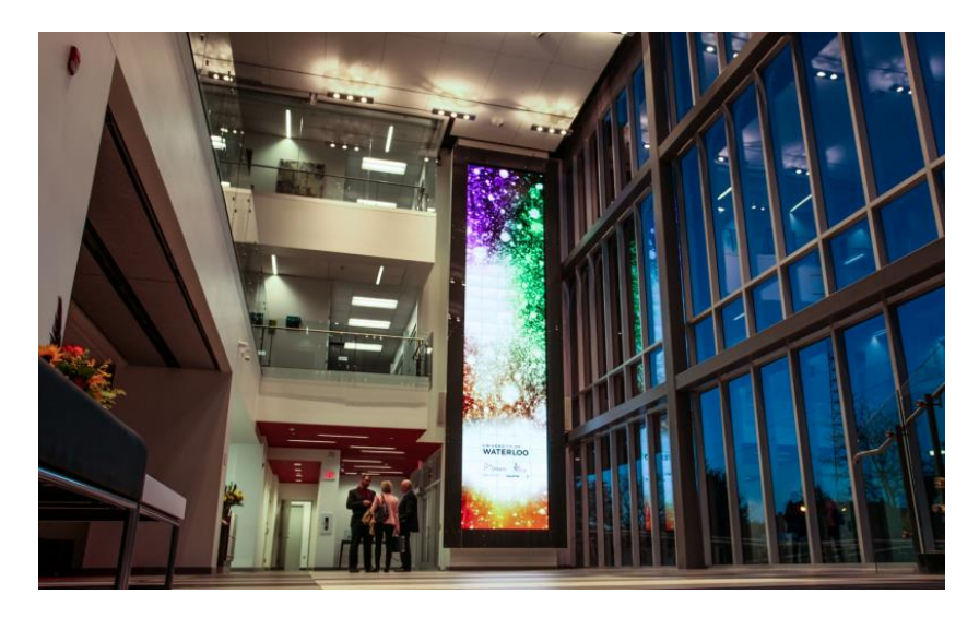
Figure 1: Media Wall at the University of Waterloo Note. From Three-Story-High Video Wall, 2013

The software that is used for this wall is the Christie JumpStart content manager program. This program allows the University of Waterloo to easily update the content specific to their needs. The end result of this project is one of the largest media walls in the world to use this type of technology with the ability to display student achievements, highlight news, or provide opportunities for individuals to showcase creative designs (Christie, 2012). This media is shown in Figure 1.