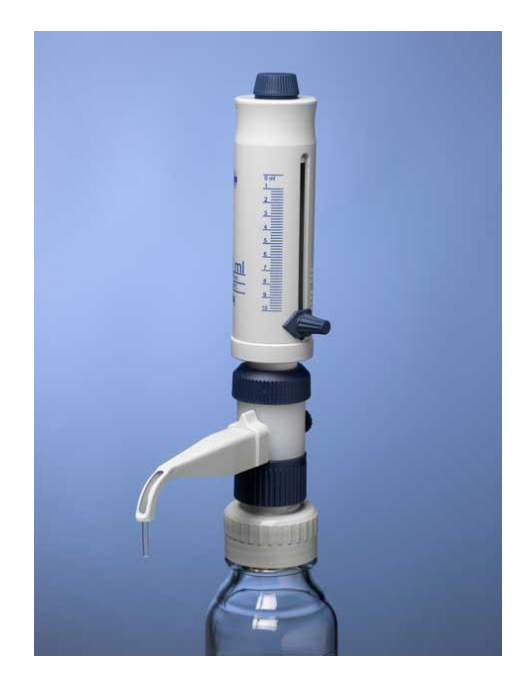
Figure 4: Labmax Universal Bottle Top Dispenser (LW0801 1)

the waste sample. This will greatly reduce the time and labour required to conduct the experiment. Two dispensers can be purchased for a total of $708.44. Alternative options such as automatic burettes and multichannel pipettes were explored but they were rejected due to high capital cost and subsequent operating cost, such as the cost of pipette tips.