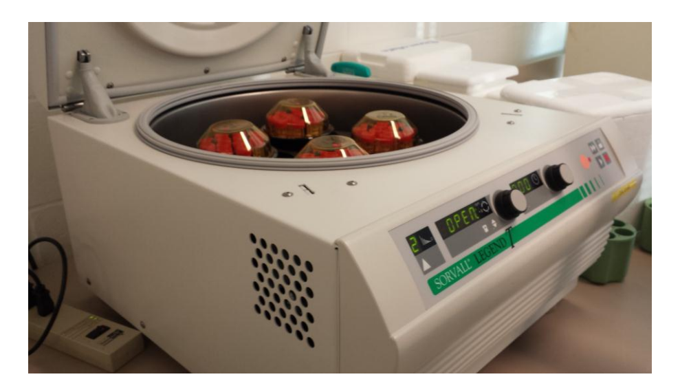
Figure 1: Thermo Scientific<sup>TM</sup> Sorvall<sup>TM</sup> Legend<sup>TM</sup> T Plus Centrifuge

The analytical balance is used to determine the chemical and precipitates weights. The centrifuge is used to separate the solid precipitate and the supernatant and is shown in Figure 1.