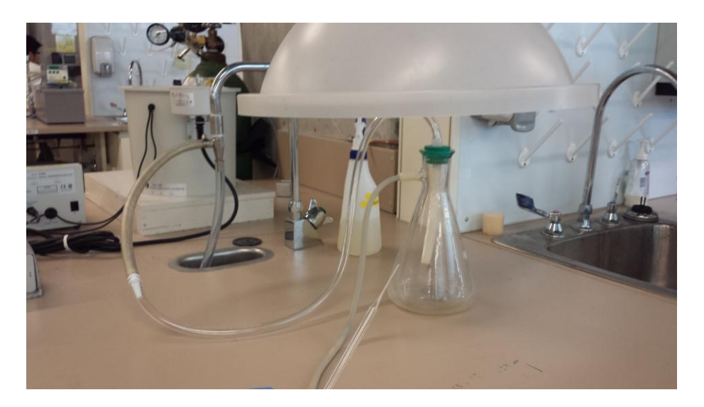
Figure 2: Laboratory Vacuum Set-Up