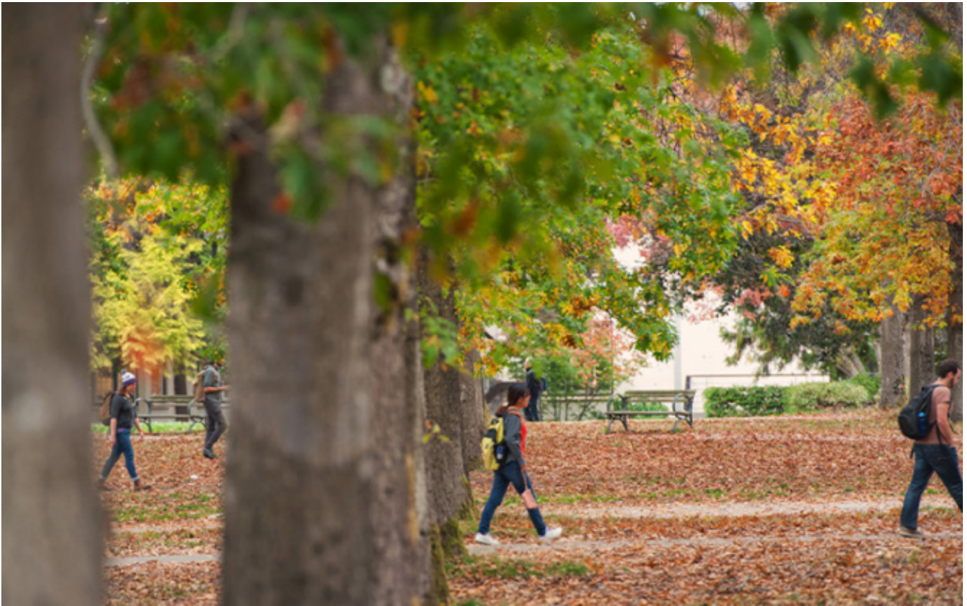
Fall at UBC Vancouver