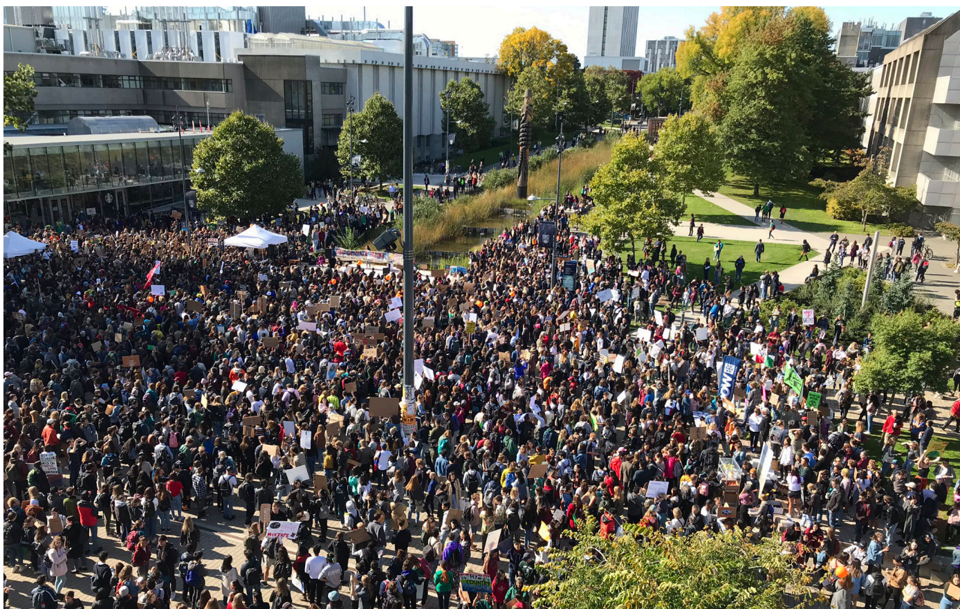
Climate Strike at UBC Vancouver (Maxwell Cameron)