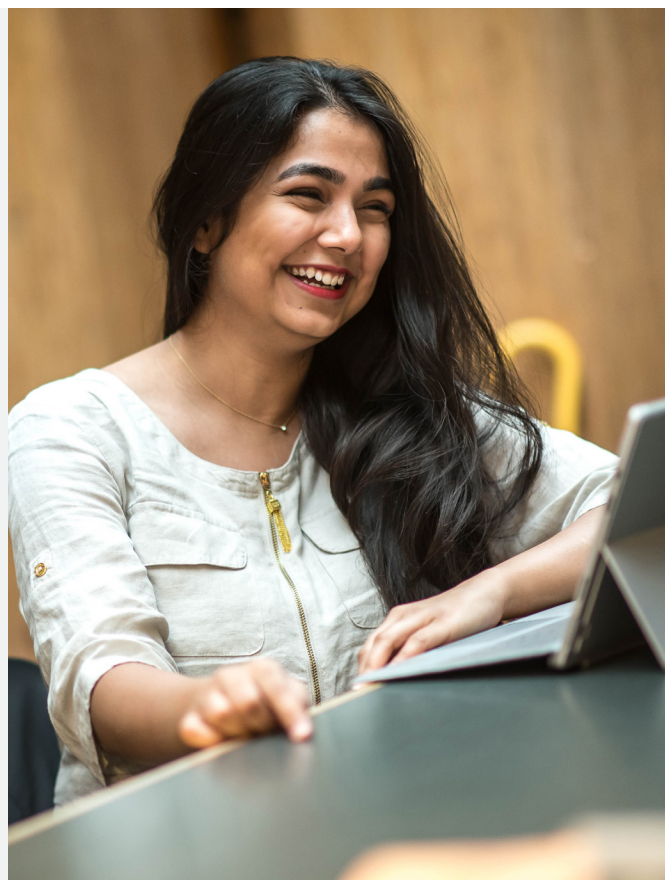
Studying UBC student

Reduce inequality within and among countries