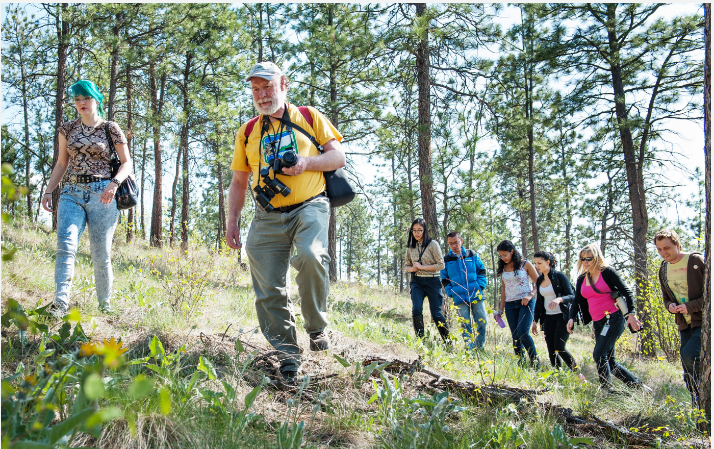
UBC Okanagan field trip

The enormous challenge of protecting the diversity of life on earth requires an interdisciplinary, multifaceted approach that interweaves Indigenous knowledge and inspires students and the community beyond the campus gates. UBC strives to meet that challenge.