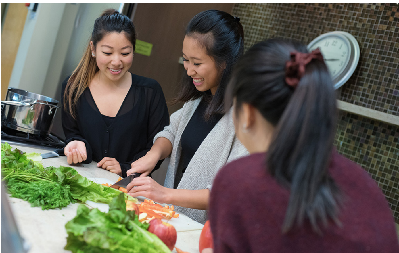
Dietetics students (Martin Dee)