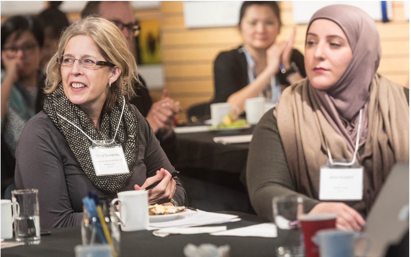
Community roundtable on migration and integration (Paul H. Joseph)