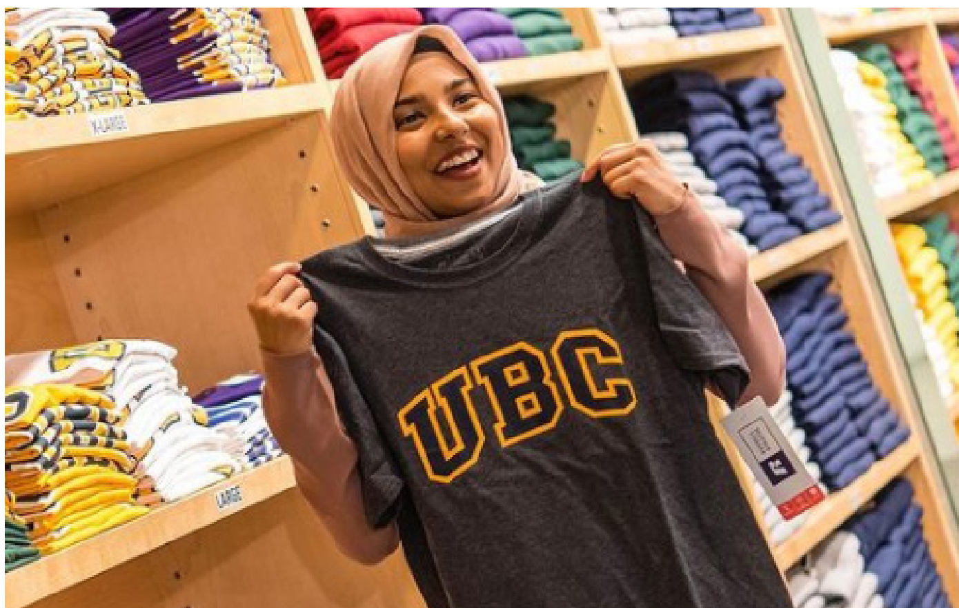
UBC is a Fair Labor Association Affiliate (UBC Bookstore)