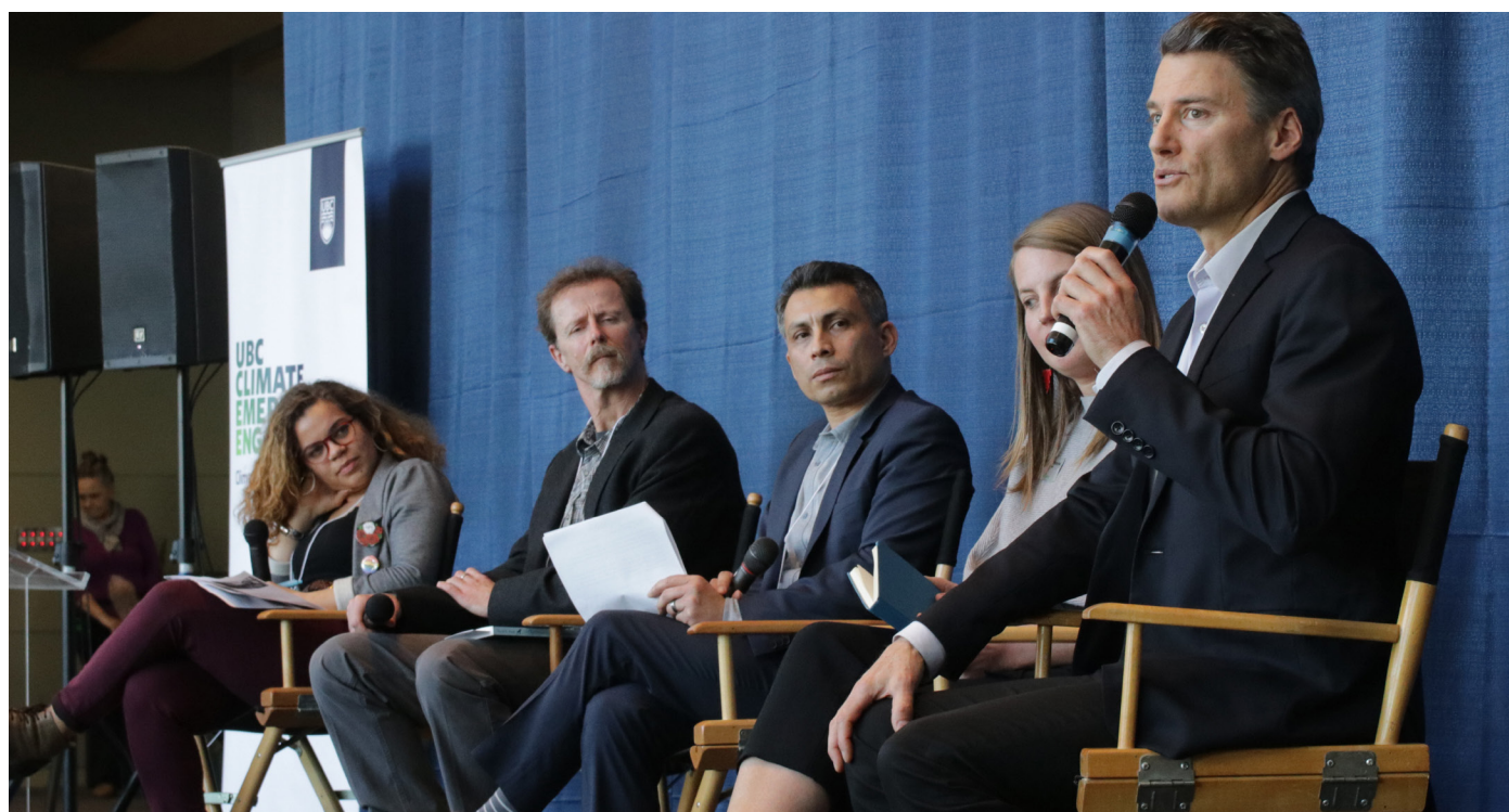
UBC climate emergency Vancouver campus-wide forum (UBC Sustainability)

Take urgent action to combat climate change and its impacts