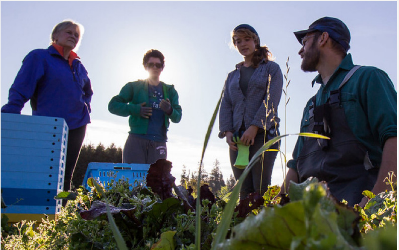
UBC Farm