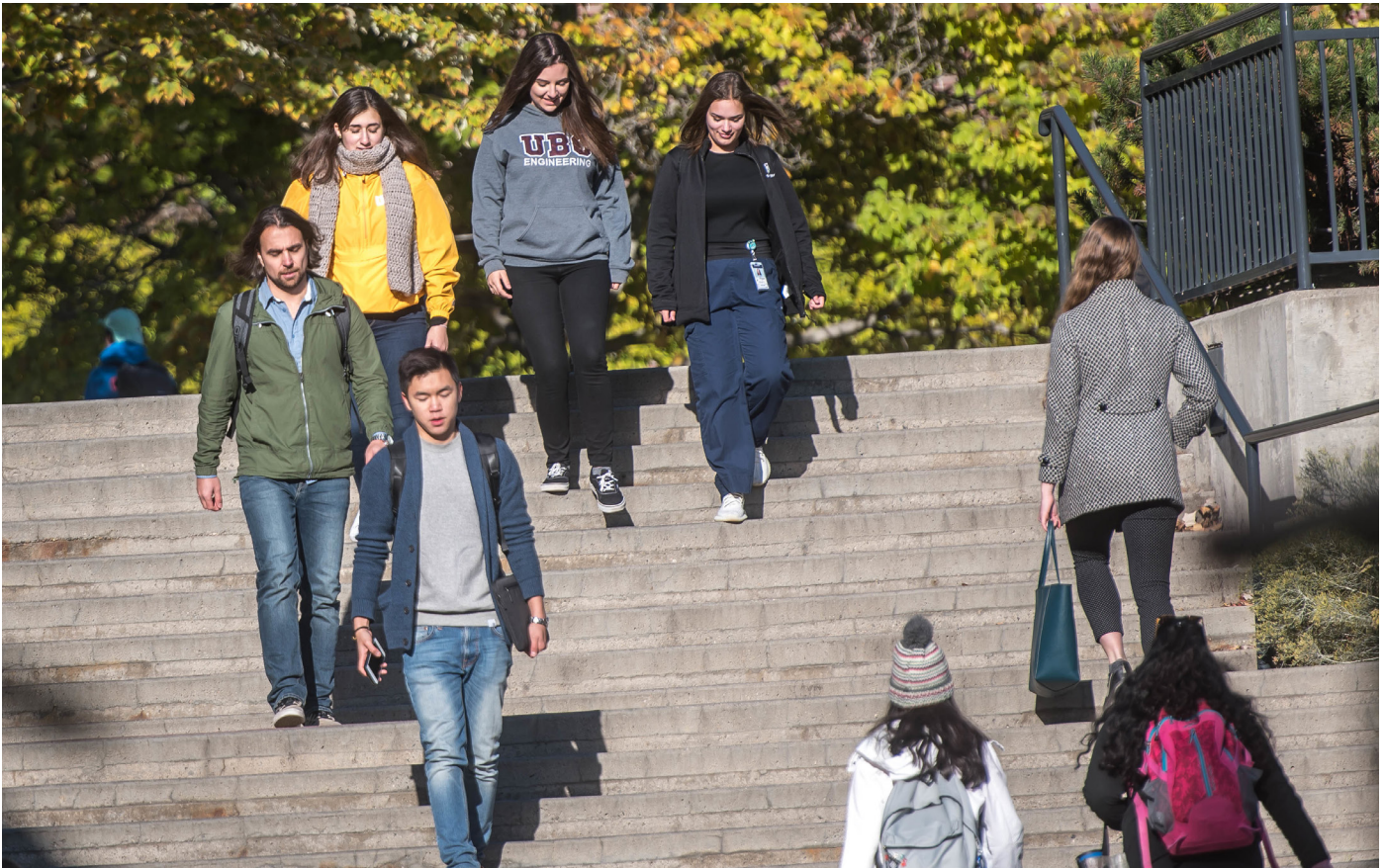
Students at UBC Okanagan