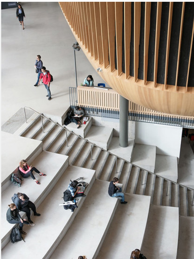
AMS Nest

Ensure sustainable consumption and production patterns