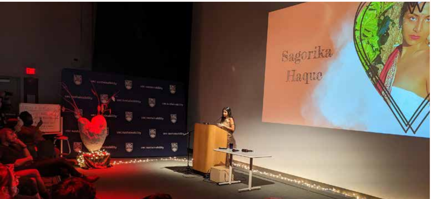
2023 Climate Slamposium