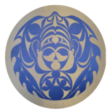
Figure 2: Central image, speaker double headed sea-serpent created by kQwa'st'not