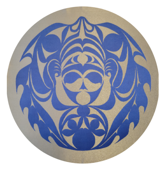
Speaker ~ double headed sea serpent