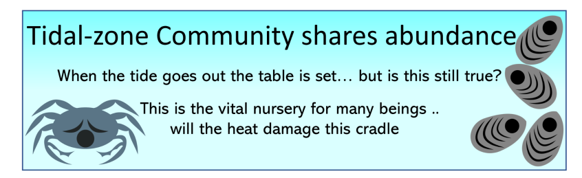
Tidal Zone Community ~ a nursery for many beings