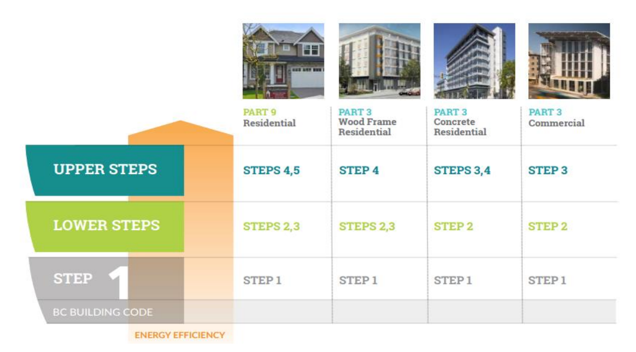
Figure 3: The number of steps with the type of buildings (Part 3 & Part 9 explained further)<sup>[4]</sup>

As a technical regulation, local governments have the option to voluntarily adopt Steps (performance requirements) to set higher energy compliance standards for builders working locally. Local governments, like the City of Surrey, cannot set their own standards, but can reference the standards set out in the Energy Step Code.