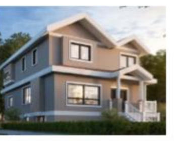
Figure 12: Example of a Medium SFD