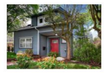
Figure 16: Example of a Small SFD

Figure 12: Example of a Medium SFD