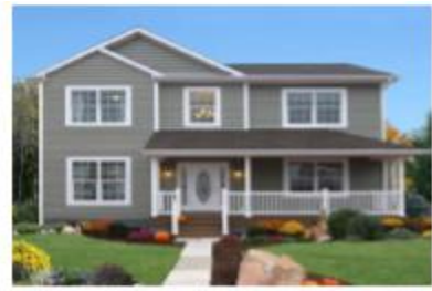
Figure 13: Example of a Large SFD