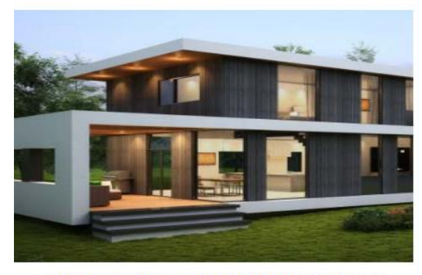
Highly energy-efficient home currently under construction in Kelowna BC (Part 9, Step 5).

Net-zero energy buildings produce as much clean energy as they consume. They are up to 80 percent more energy efficient than a typical new building, and use on-site (or near-site) renewable energy systems to produce the remaining energy they need. A net-zero energy ready building is one that has been designed and built to a level of performance such that it could, with the addition of solar panels or other renewable energy technologies, achieve net-zero energy performance.