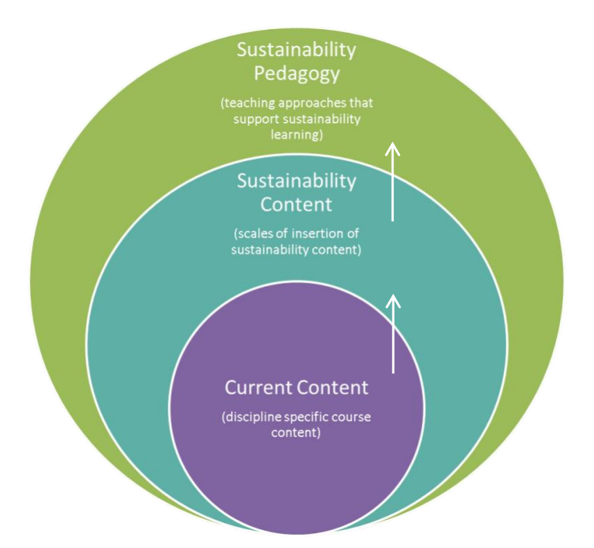
Figure 1. Part 1 of this paper examines how to insert sustainability content into an existing first year course. Part 2 highlights pedagogies that support sustainability learning. The ultimate goal is to revise an existing discipline-specific course (purple circle) to include sustainability content (blue circle) and also ideally to employ pedagogies that support sustainability learning (green circle).

The UBC Sustainability Initiative (USI) is dedicated to increasing student exposure and education in the field of Sustainability. UBC's ultimate goal is for every student to have access to, and hopefully pursue, a sustainability learning pathway¹ alongside their disciplinary education. These pathways are intended to ground students in the four UBC Student Sustainability Attributes: Holism, Sustainability Knowledge, Awareness & Integration, and Action for Positive Change (USI, 2013). A critical step towards achieving this goal is to stimulate student interest in sustainability early in undergraduate programs. In order to reach students in first year, the USI is encouraging and supporting instructors, departments and faculties to revise a broad spectrum of existing introductory courses by inserting sustainability content and using pedagogies that support sustainability learning (Figure 1). The intent is for these transformed courses to motivate students to enroll in a sustainability learning pathway early in their undergraduate education at UBC.