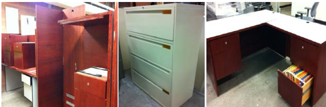
Photos of actual items that have been posted on the re-use it! UBC site and adopted by another department.