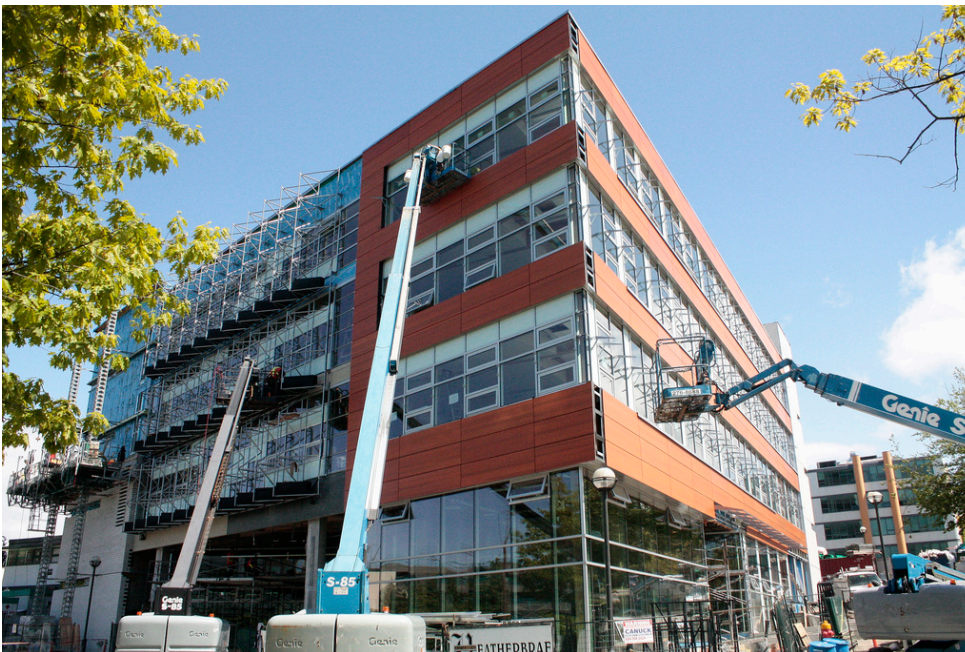
CIRS building under construction, June 2011.