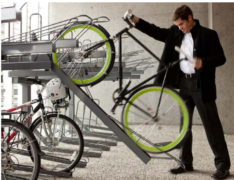
Testing out the new hydraulic bike lift at Buchanan Tower.