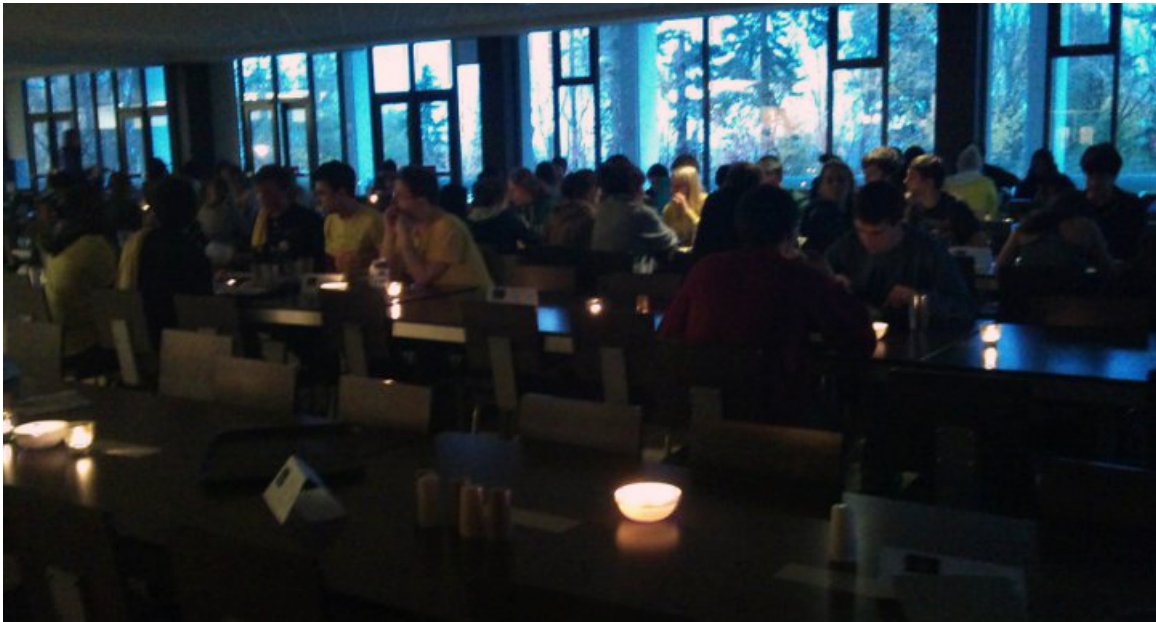
Residents of Totem Park dine by candlelight during the 'Do it in the Dark' competition.