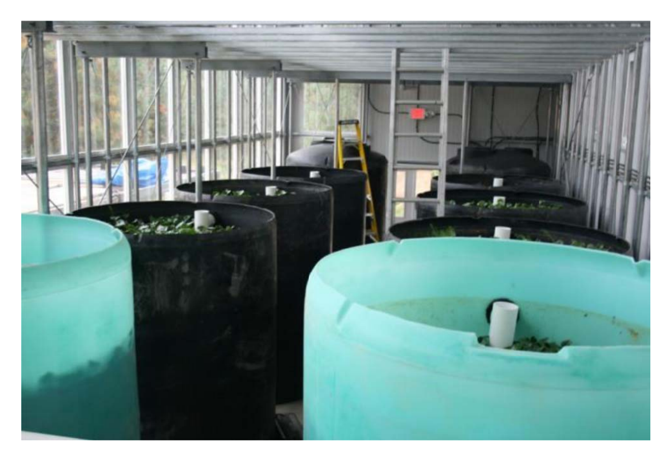
Figure 2 Solar Aquatics System – Christina Lake BC

The UBC Farm building is to be built on approximately 1800 m<sup>2</sup> of area and has 3 floors (A. Rushmere, personal communication, March 27, 2012). If we consider a similar project completed by ECO-TEK in Christina Lake, BC (Rink et al., 2010) then the installation of the SAS in the UBC Farm Center Building has an approximate capital cost of $440,000 and an operating cost of $15,000 per year.