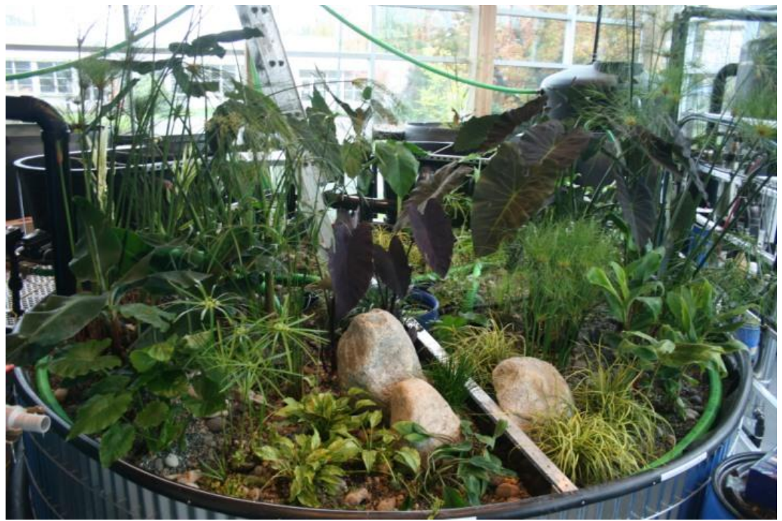
Figure 3: An aeration tank of the Solar Aquatic System.