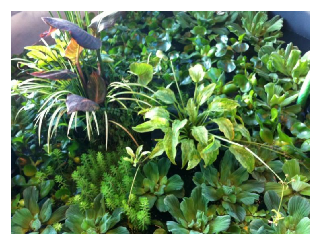
Figure 2: Part of the UBC CIRS Solar Aquatic System.

Almost nothing. The water can be reclaimed to flush toilets and irrigate gardens and is chlorinated.