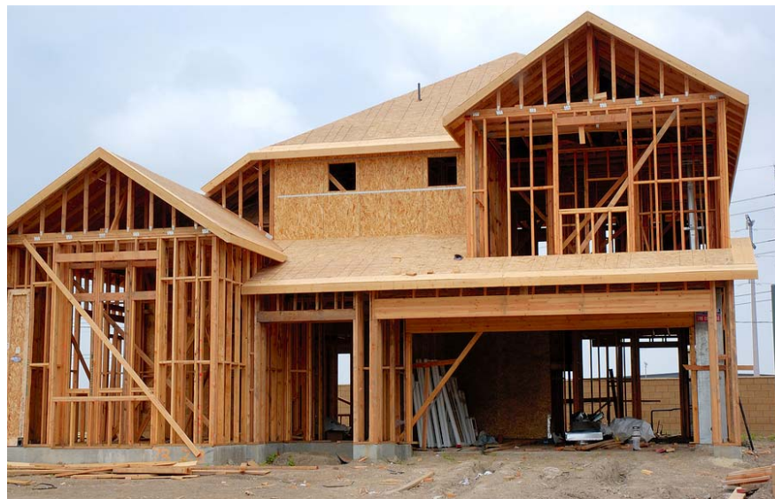
Figure 5: Wooden house frame

Hard wood comes from trees such as oak. First, it has to be cut down by either lumberjacks or machines and then processed in saw mills. Figure 5 shows a two stories house built entirely out of wood. This creates different job opportunities in both the logging industry and the saw mill with jobs such as lumberjacks and lumber mill workers.