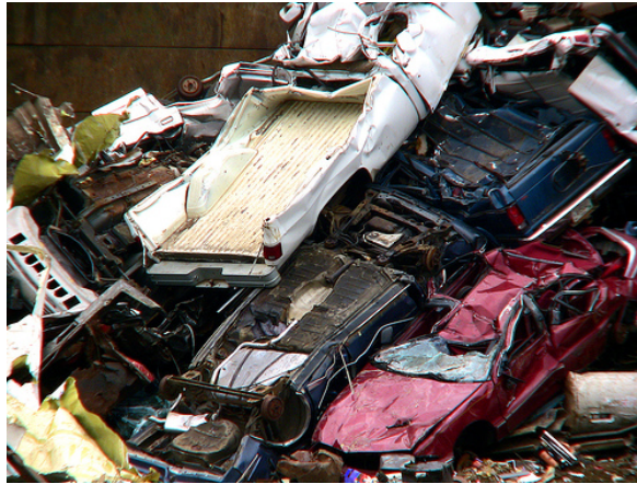
Figure 9: Steel recycling from cars