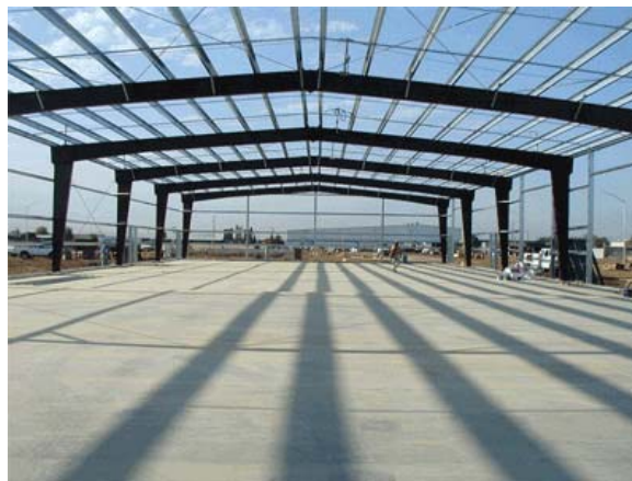
Figure 10: Pre-engineered steel structure.