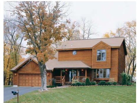
Figure 7: Typical house made from lumber and timber

Only some of the main types of wood construction types is stud-wall frame with plywood/gypsum board sheathing (Figure 7), which is popular worldwide and is the main type used in the United States (WHE Report 90), Canada (WHE Report 82), and Japan (WHE Report 86). For this type, walls are made of vertical timber elements of rectangular cross section covered in light plywood or composite sheathing, with roofs made of timber members or prefabricated trusses, which are sheathed similar to the walls. The building foundations are usually concrete but sometimes are made of stone.