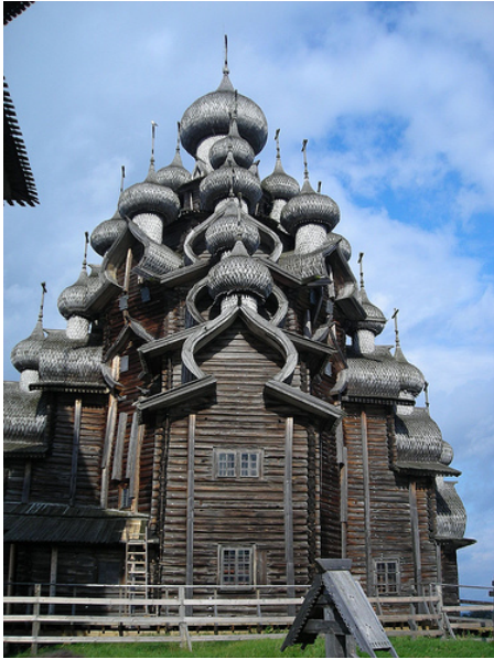
Figure 1: Wooden Russian church

Wood has been one of the primary sources of building material of humans for thousands of years. From the great ancient wooden palaces in China to the towering wooden churches in Russia (Figure 1), human beings had created countless architecture marvels that they have become as much part of our culture as they are our history. Even today, people such as the Japanese and majority of the population in North America still prefer their structures and houses (Figure 2) to be built in wood than their concrete or brick counter parts. For the Japanese, the use of wood and paper in their buildings is a part of their undying tradition, while for the people in North America it is mainly an economical reason due to the fact of the easier accessibility in their part of the world.