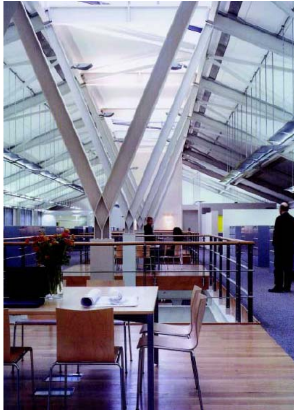
Figure 13: Steel Structure in Arup Campus

If student know that their new SUB has steel reinforcements, then they will feel more comfortable and are assured that it will never topple in case an earthquake. This means having visible steel structure. This idea has been implemented in Arup Campus in Blythe Valley Park, West Midlands (See figure 13).