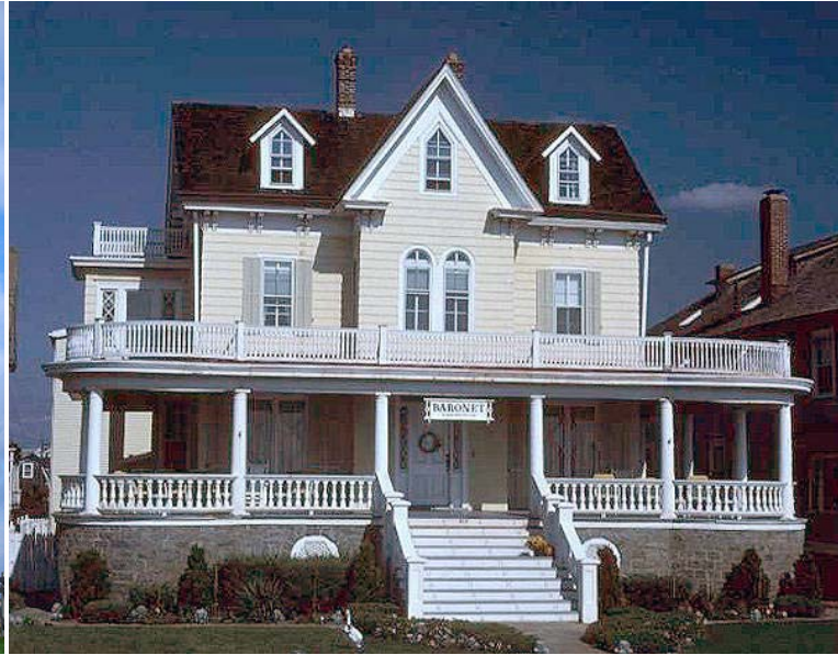
Figure 2: A typical 19th century North American house

Wood is a green and sustainable material in the sense that it is a natural and renewable resource that is available aplenty in the province of British Columbia, which is where our new Student Union Building (SUB) will be build at. Due to its cheaper costs, lower environmental impact and long history of usage in North America, wood is one of the most suitable building materials that is available to construction of the new SUB.