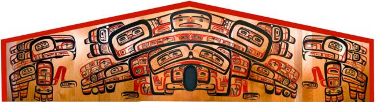
Figure 6: Haida wooden carving

cooler during summer. Wooden building can also be decorated with beautiful wooden carvings such as the first nation arts and crafts (See figure 6) which are not only beautiful to look at, but also introduce the first nation cultures to both local and international students.