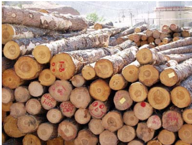
Figure 4: Lumber Industry

Hard wood is one of the cheaper construction materials comparing to both steel and concrete due to the sheer abundance of it in British Columbia. The lumber industry (See figure 4) is also one of the main exports and income of this province which leads to the few following advantages: