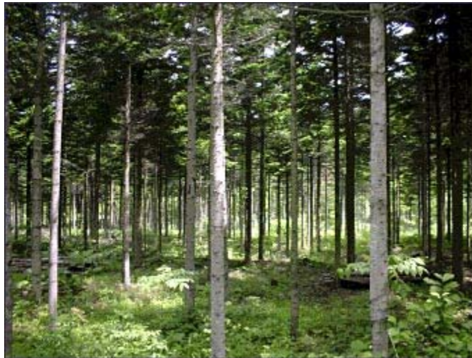
Figure 3: Oak forest

With all the advantages listed above, hard wood also comes with a whole array of disadvantages.