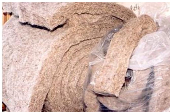
Figure 1 Batch of Wool Insulation

In the lower mainland of British Columbia, the minimum code requirement for insulation is R-20 in the walls and basement walls, and R-40 in the ceiling. [9] This means that you would require approximately 6-inches of wool insulation in the walls and 12-inches in the ceilings. Wool insulation is available as a batch or a rope. Ropes are used to insulate around doors and windows and are sold in rolls. They cost about $0.75 per foot. Batches are used to insulate walls and ceilings. They are available in rolls of 16-inches or 24-inches wide with an R-value of 19 and cost approximately $2.40 per square foot. [10] The price of the insulation usually includes installation costs, so you don't need to spend extra for installation.