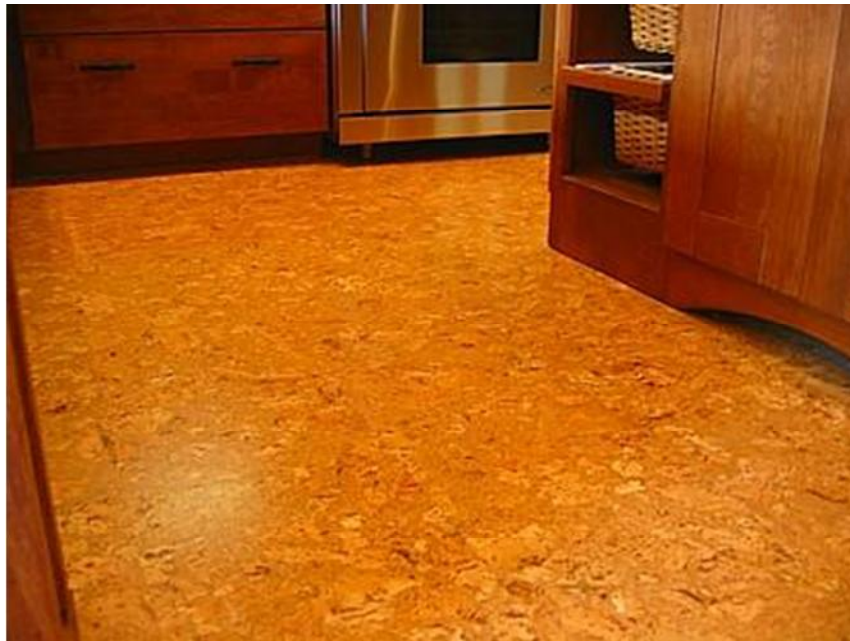
Figure 3 Cork Floor

Cork floors have many properties that give it some advantages over hardwood floors. Cork floors are softer when compared to hardwood and they have many tiny air pockets trapped within them. These air pockets allow the cork floors to have good thermal insulation and sound proofing. Cork floors are not susceptible to damage. They can resist denting and scratching because of its elastic like property. Cork flooring can compress up to 40% and still come back to its original shape. [22] It is also resilient to water damage, mold, mildew and pests. The aesthetics of cork flooring is also very pleasant. They are available in many different shapes, colors and sizes. Another bonus property that cork floors have is that they are very comfortable to walk on. It feels like walking with running shoes on because it is really soft and has some give.