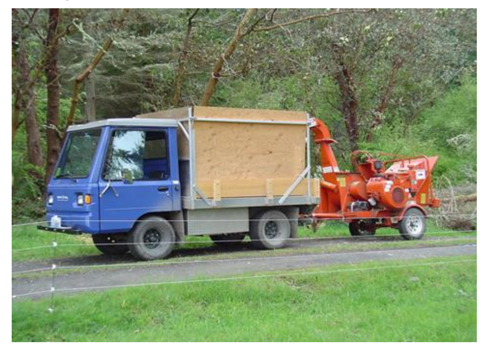
Figure 8: The Might-E Truck

After completing our research and comparing our four types of vehicles, we have come to the conclusion that the best choice for the UBC Farm would be an Electric Vehicle (EV). As discussed in the previous section, the zero tailpipe emissions and reduced noise pollution mean EVs are significantly better than the other options in both the environmental and social aspects. The only issue with selecting an EV is the price, however, we have found a truck known as the Might-E Truck (manufactured by Canadian Electric Vehicles Ltd. on Vancouver Island) that costs only around $22,000 new (Ecarco). This may seem too expensive, however, with the CEV rebate from the BC government we believe that this is the best option for the UBC Farm in the long term. To conclude, the impressive benefits associated with the Might-E Truck (and EVs in general) as well as the fact that the truck meets all of the specifications and requirements set by Véronik Campbell make it the obvious choice as the new vehicle for the UBC Farm.