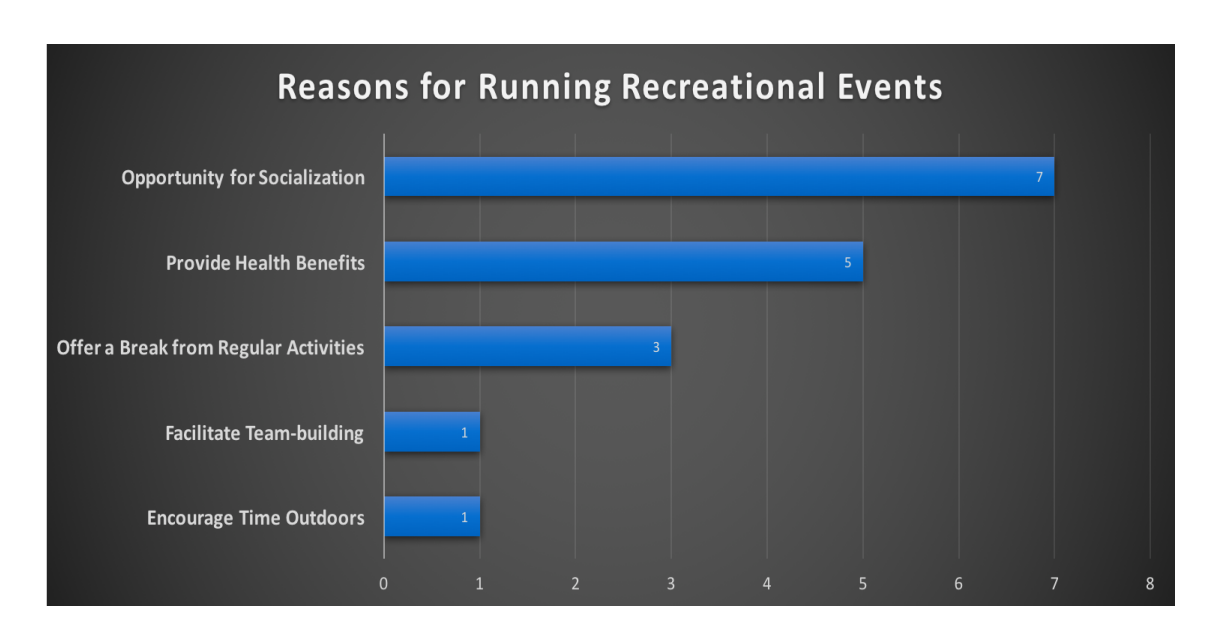
Figure 2 : Response totals to question: "Why do you run events that involve physical activity or recreation? What value do you think they have? (Please select 2)" (Total number of respondents: 8)